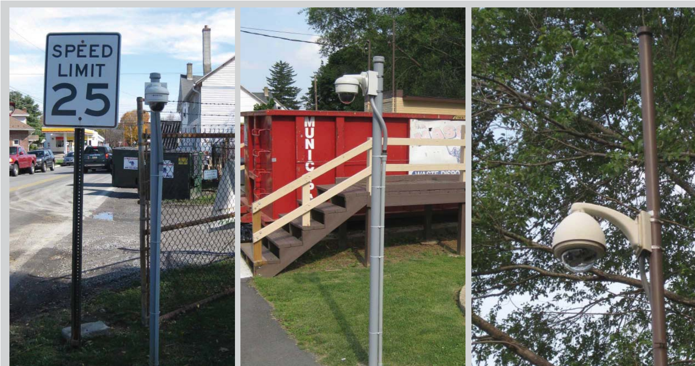
3 strategically placed Arecont Vision Megapixel Cameras capture illegal dumping activity at the Alburdis, PA waste facility.

ing, H.264 compression to minimize bandwidth and storage needs, and because of the availability of a 180-degree panoramic megapixel solution.