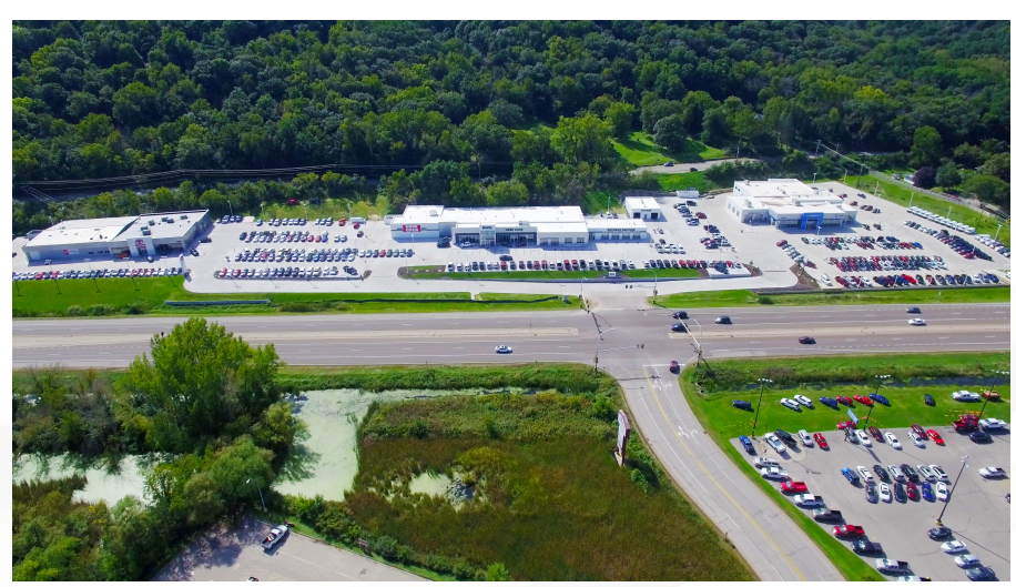
DAHL Auto Plaza Winona Campus