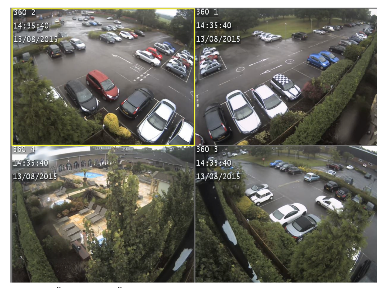
Arecont Vision<sup>®</sup> SurroundVideo<sup>®</sup> 360° cameras cover the grounds and parking areas at Nirvana Spa

Significant cost benefits were delivered by requiring fewer cameras and less supporting infrastructure. The SurroundVideo<sup>®</sup> panoramic megapixel camera solution is also less taxing on the IP network due to H.264 compression and bit rate control capabilities.