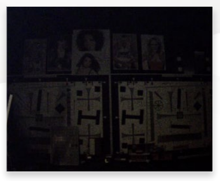
Color Image without NightView Technology at .02 Lux

In addition to NightView models, all MicroDome G2 camera models are equipped with True Day/Night operation, and MicroDome G2 cameras that are 3MP or higher include pixel binning to increase sensitivity.