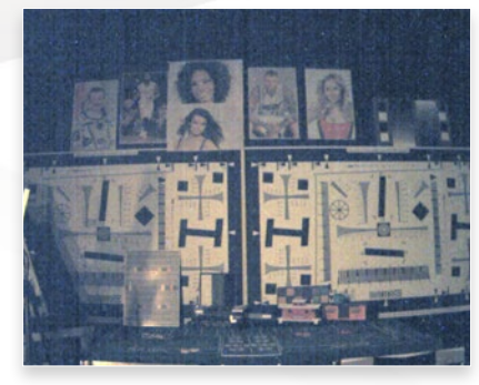
Color Image with NightView Technology at .02 Lux