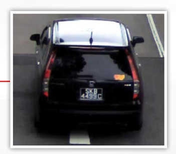
Telephoto Field of View