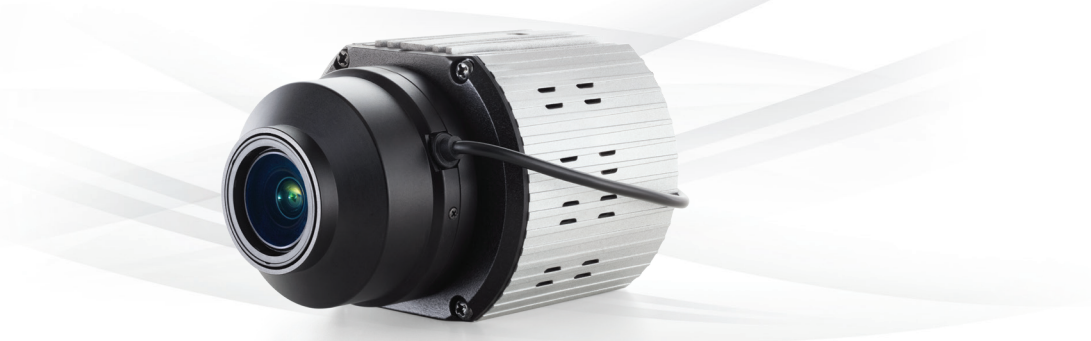
Lens Sold Separately

12 Megapixel (MP) H.264 True Day/Night Indoor Box-Style IP Camera with SNAPstream™ (Smart Noise Adaptation and Processing), NightView™, and WDR (Wide Dynamic Range)