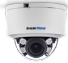
Surface mount dome

Create Your Model (Example: AV05CID-100)