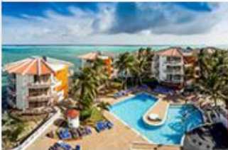
Hotels And Hospitality