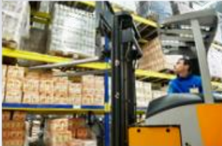
Warehouses - Distribution - Logistics