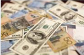
Banking And Finance