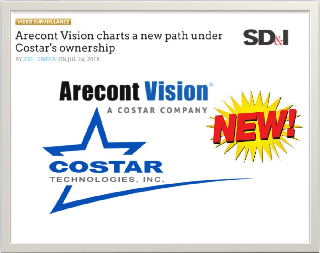
Industry editorial coverage of Arecont Vision Costar launch