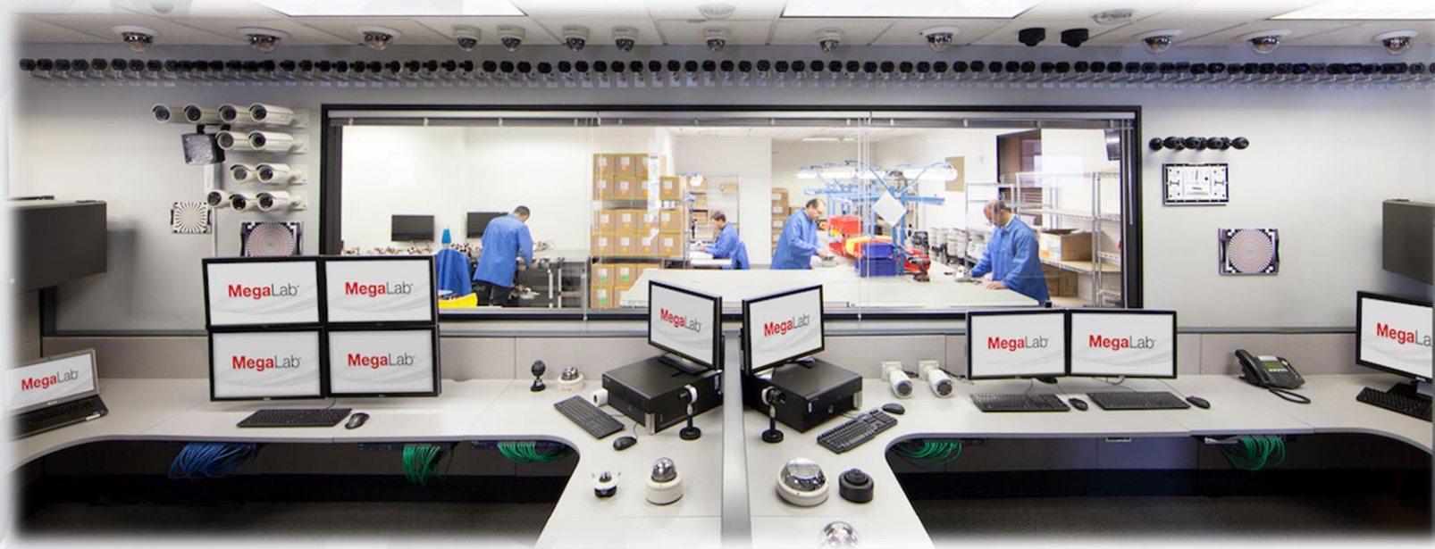
AV Costar MegaLab™ Test & Validation Center