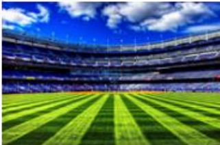
Stadiums And Large Venues