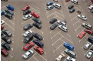
Parking Lots And Structures